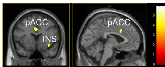
Fig. 3. Baseline brain activity predicting subsequent pain-intensity ratings. High baseline activity in the pain-related pACC and insula (Ins) predicts a sensation of higher pain intensity in response to painful-range laser stimuli. Results reflect a 24-subject group analysis masked by pain-intensity-related areas contrasted with the first analysis, thresholded at an uncorrected P value of <0.001 , and displayed on a canonical MR template. Color scale refers to T values of individual voxels.